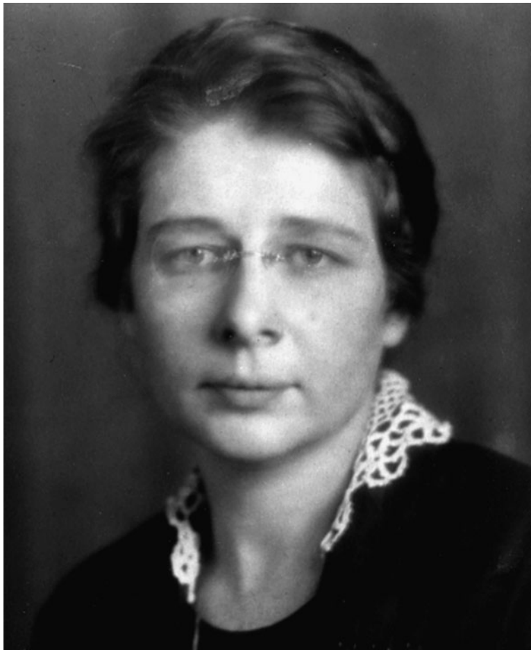
Ida Pauline Rolf, PhD (1896–1979) in 1924.